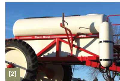
[1] Rubber torsion boom suspension [2] Custom tank [3] Center pivot boom [4] Boom valves [5] Welded steel frame

Farm King High-Clearance Sprayers are the market leader in features and quality. Custom tanks are available in 850, 1200 or 1600 U.S. gallons and are the ideal options for midsize to large operations looking to control their own spraying season. A suspended center pivot boom is standard with 60, 80 or 90' lengths.